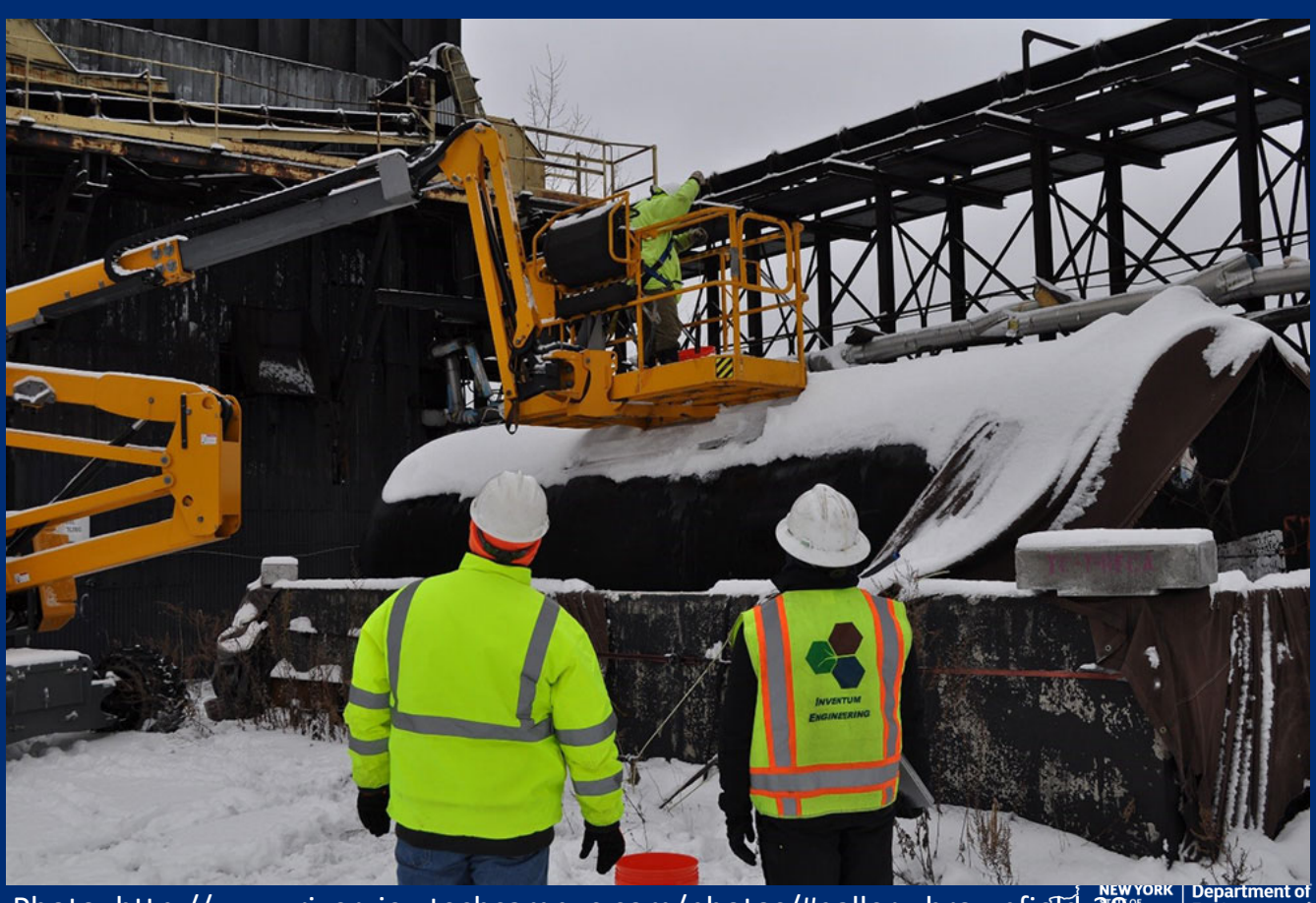
Photo: http://www.riverviewtechcampus.com/photos/#gallery-brownfield-38 Department Conservation